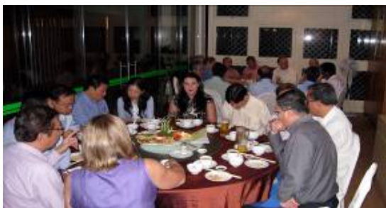
The talk was followed by a sumptuous Chinese dinner *****

The question and answer session was interesting with many Rotary members feeling that in reality very few businesses are truly altruistic in their giving.