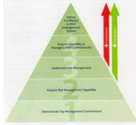
The 5 Levels of bizSAFE

The Council comprises of 16 leaders from the major industry sectors, the Government, unions and professionals from the legal, insurance and academic fields. The Act that was passed by Parliament covers the industries with the highest risks, factories, construction, shipyards, airports, the docks etc. As half of Singapore's workforce is employed by small and medium enterprises that have less resources and manpower, the WSH council has introduced bizSAFE. The bizSAFE programme promotes workplace safety and health through the recognition of the respective members' safety and health efforts. There are five different levels to achieve and the members are graded accordingly. Achieving good grades inevitably reflects on the quality of a member. The bizSAFE community (of over 1,800 members) comprises of bizSAFE enterprises, partners and mentors. bizSAFE has different categories which are able to be used in advertising, with 3,500 only having the top rating of the star.