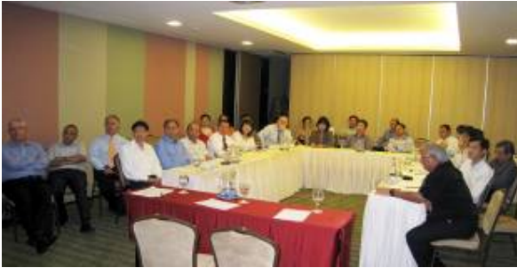
The attentive audience at the Joint Meeting

More videos clips followed where there are live examples of environmental friendly motor car inventions, for example, Japanese water powered car which takes 1 litre of water to run 80km, an "air" car powered by compressed air and an electric car that can accelerate faster than Porsche and Ferrari.