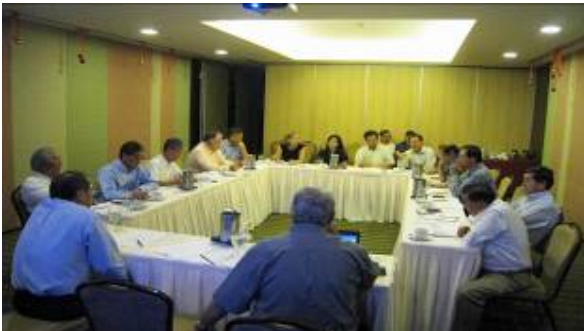
The AGM held at the SGCC Function Room

she was dyslexic while doing her postgraduate studies in Australia. Her concern for students who were under-achieving and experiencing reading difficulties led her to her PhD research. She was clinically trained in Australia and has extensive experience working with youth in schools as well as in the prison ministry.