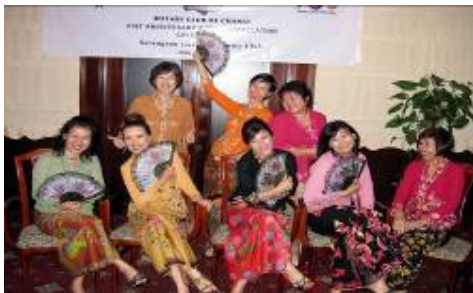
These ladies dressed in Peranakan attire sure look casual and relaxed