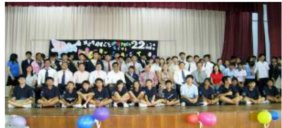
At the 22 nd Installation of PeiCai Interact Club

22nd Installation of PeiCai Interact Club BOD took place in August and the 3rd Installation of ACS(International) Interact Club earlier that same month.