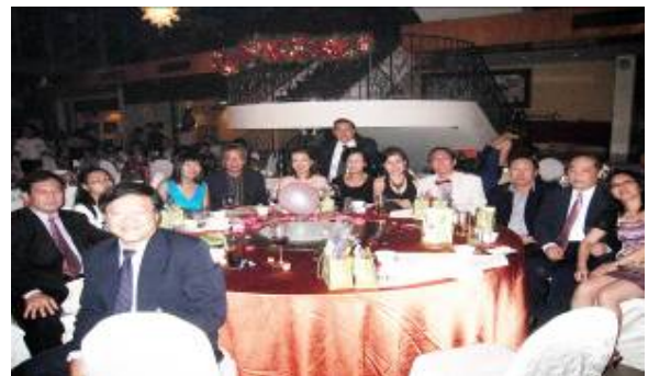
Our last Fellowship Dinner together in 2009.