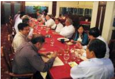
The usual enjoyable fellowship dinner at the latter part of meeting.

The Club enjoyed the usual high standard of fellowship and the move to the new wing at SGCC added to the already high quality of the meetings. Attendance has been hovering around 60% for the reporting period.