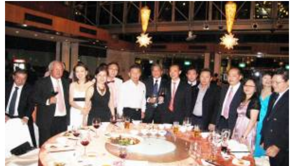
Photo taken with Mr George Yeo (8 th from the left) when he visited our 'VIP 2' table

Our meeting on 30 th December '09 was replaced by a New Year Countdown Dinner with members of Serangoon Gardens Country Club at the clubhouse. The guest of honour that night was Singapore's Minister of Foreign Affairs, Mr George Yeo.