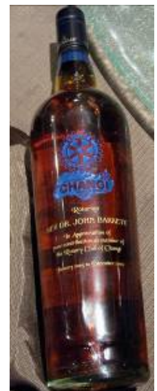
The Farewell Gift